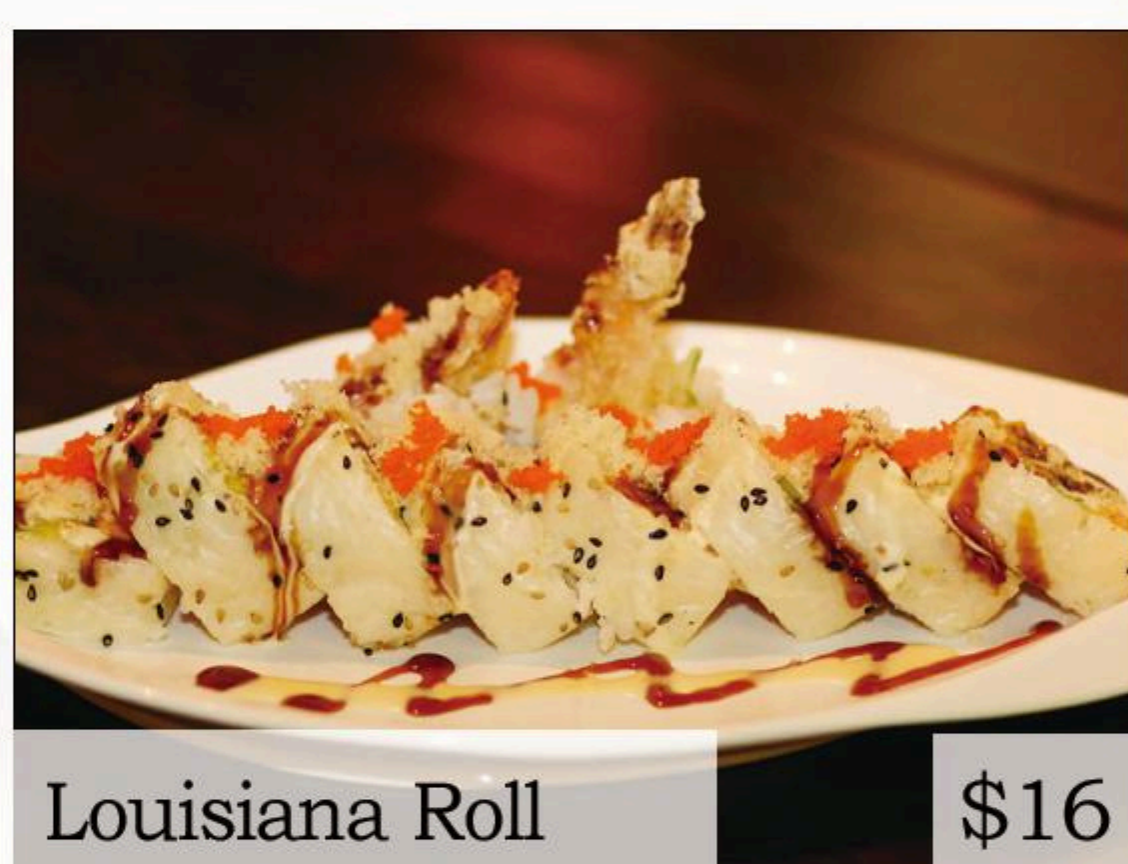
Louisiana Roll $16

shrimp tempura, cucumber, avocado, asparagus, spicy crab salad, topped with seared sliced beef and teriyaki sauce