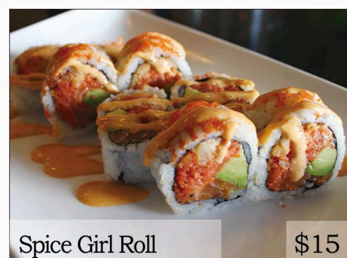
Spice Girl Roll $15

spicy tuna, yellowtail, seaweed salad & asparagus wrapped inside with eel, salmon & avocado on top, drizzled in spicy mayo, wasabi mayo, topped with eel & miso sauces