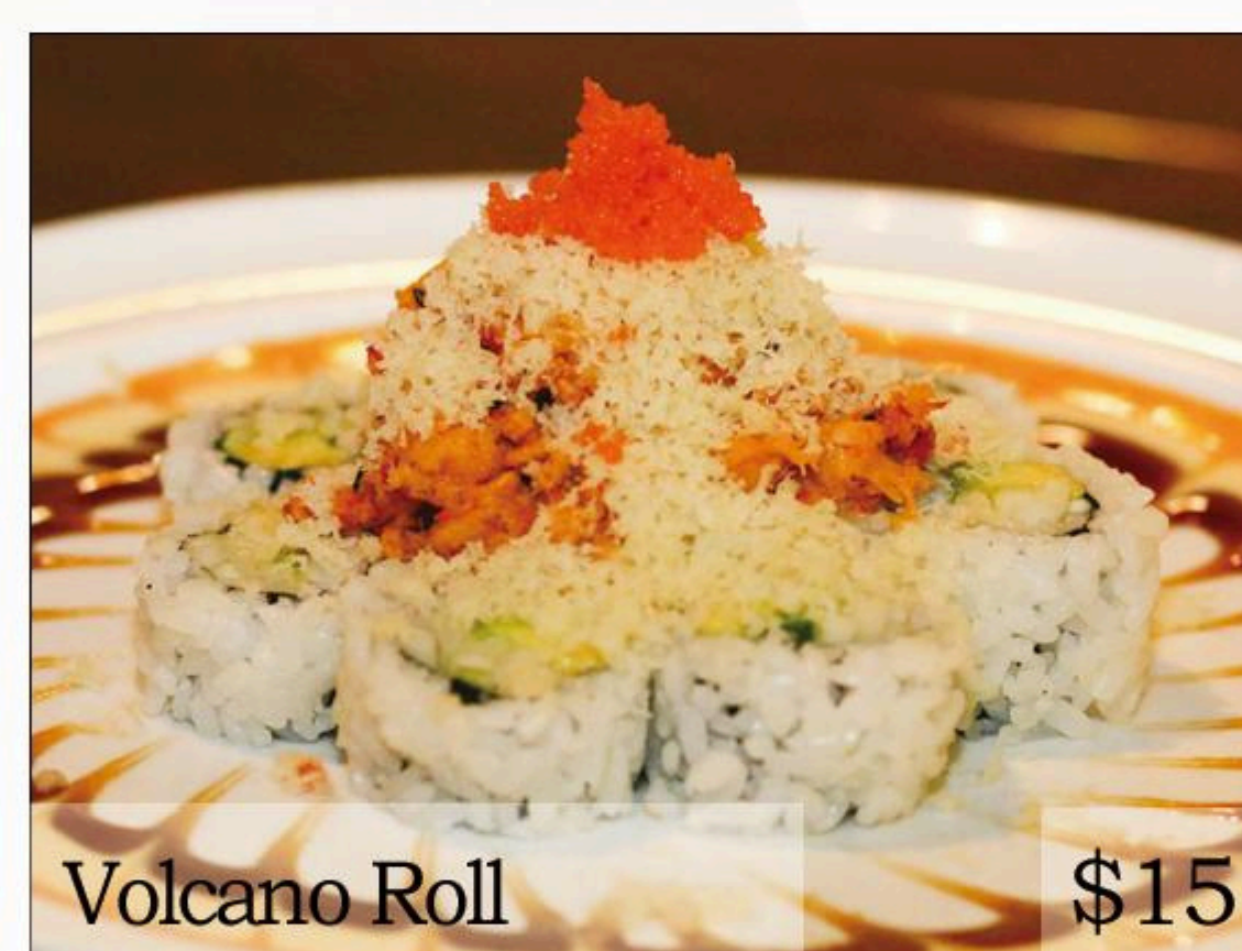
Volcano Roll $15

shrimp tempura, avocado, cucumber & jalapeño, wrapped in sesame soy paper and drizzled with eel and yummy vinegar sauce