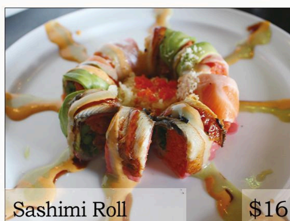
Sashimi Roll $16

spicy yellowtail & tuna topped with spicy, crunchy crab salad, topped with tempura flakes and drizzled in wasabi sauce