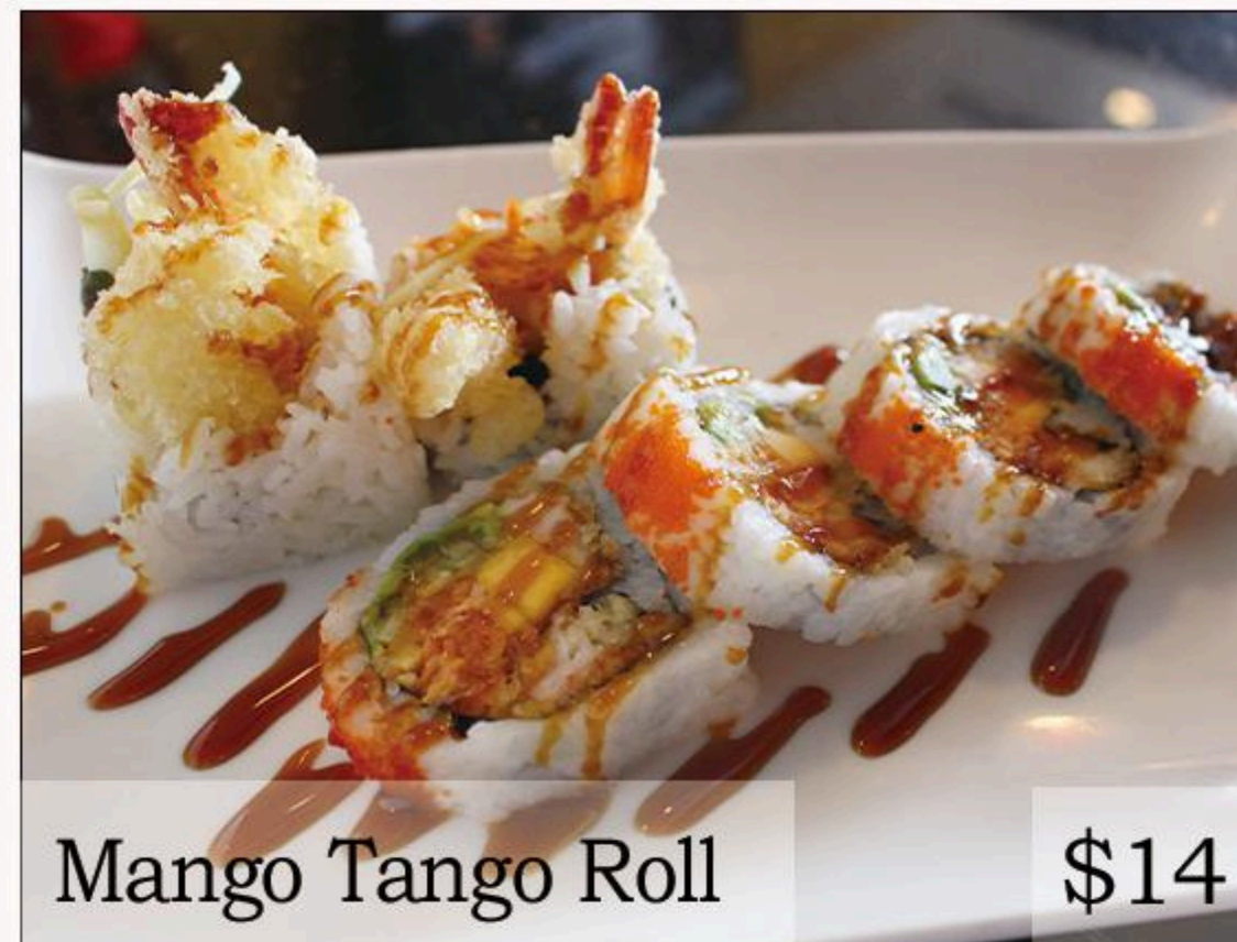
Mango Tango Roll $14

deep fried roll with spicy tuna, spicy salmon, crabstick, avocado, topped with 3 kinds of tobiko and drizzled with spicy mayo and eel sauce