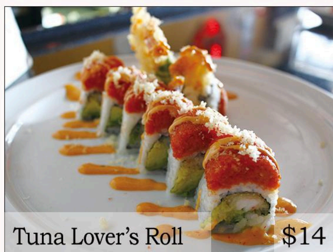
Tuna Lover's Roll $14

deep fried rice wrapped in seaweed, topped with spicy tuna, drizzled with miso and wasabi sauce