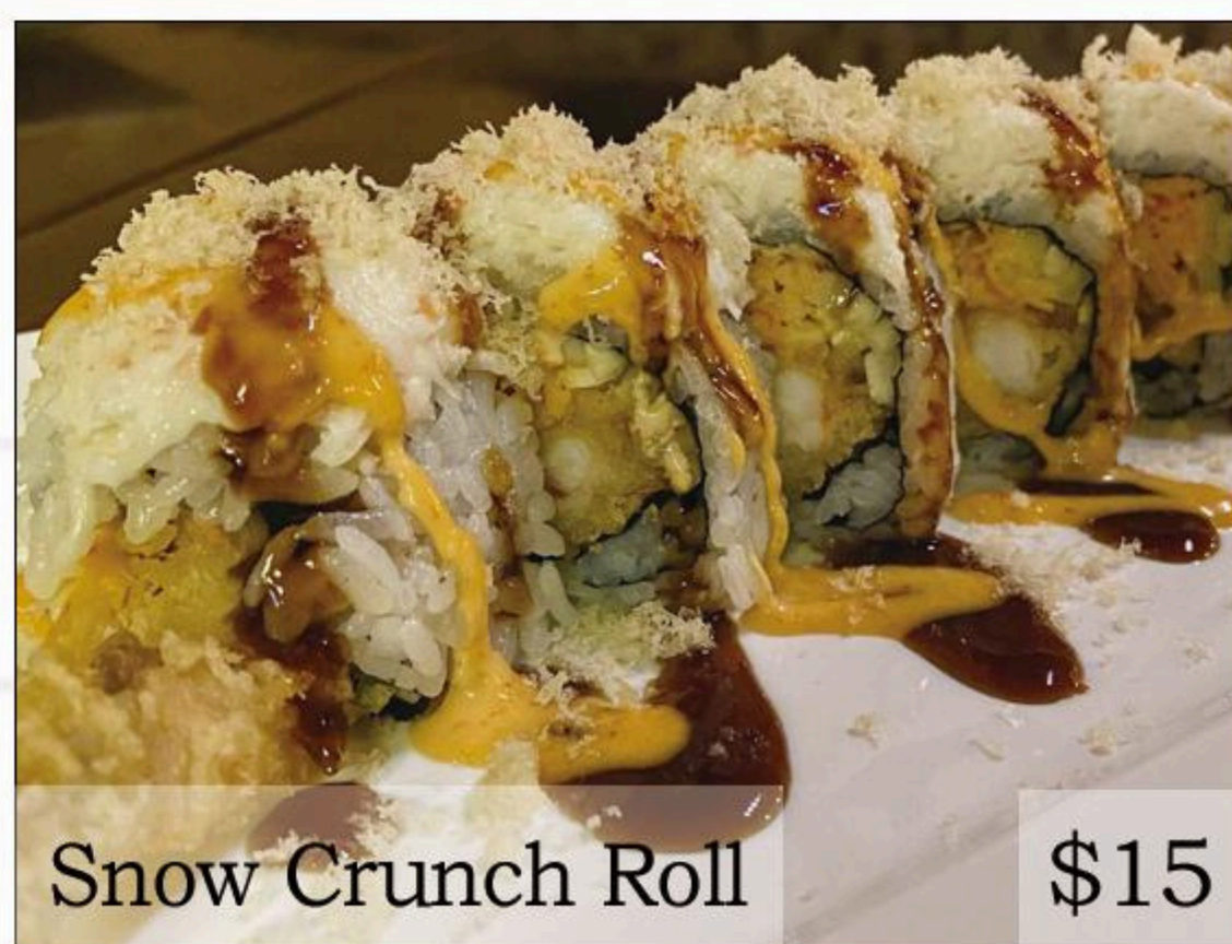
Snow Crunch Roll $15

snow crab, spicy kani, mango, cucumber topped with avocado, drizzled with plum and wasabi sauce