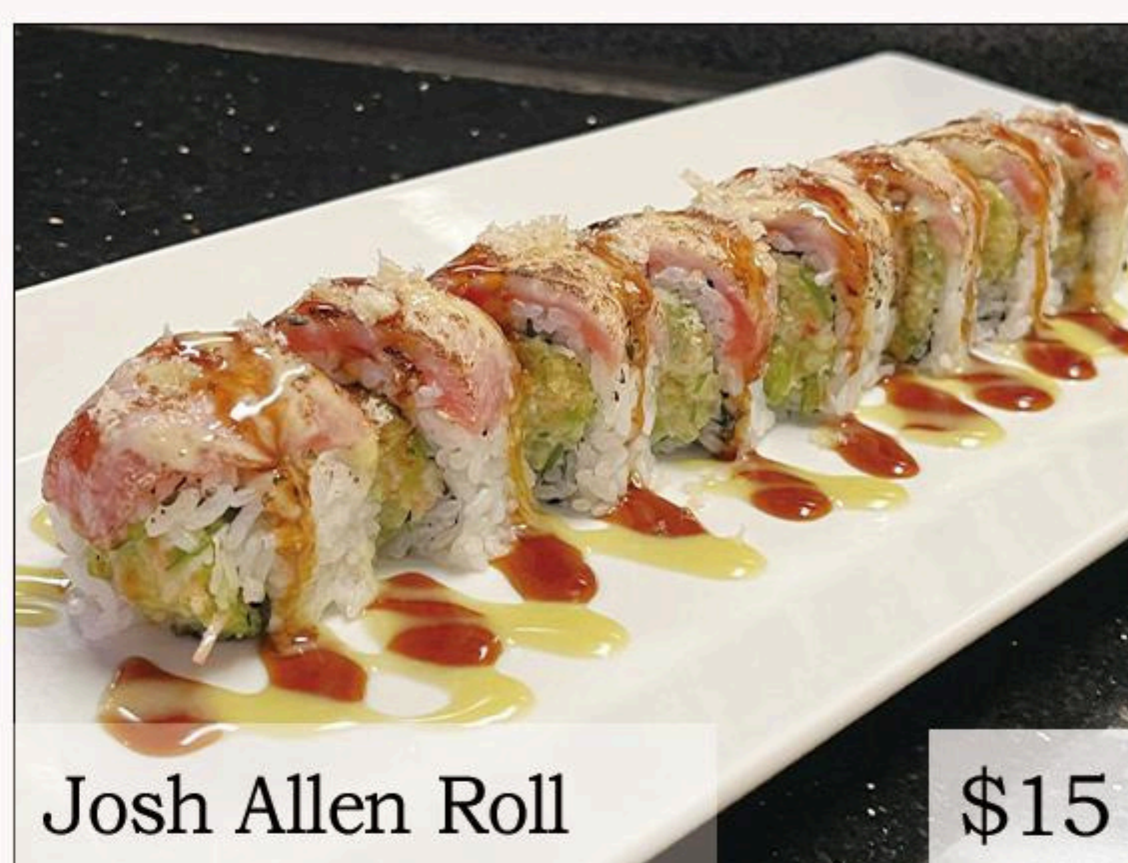
Josh Allen Roll $15

deep fried jalapeño stuffed with avocado, cream cheese & snow crab, topped with eel sauce & sriracha