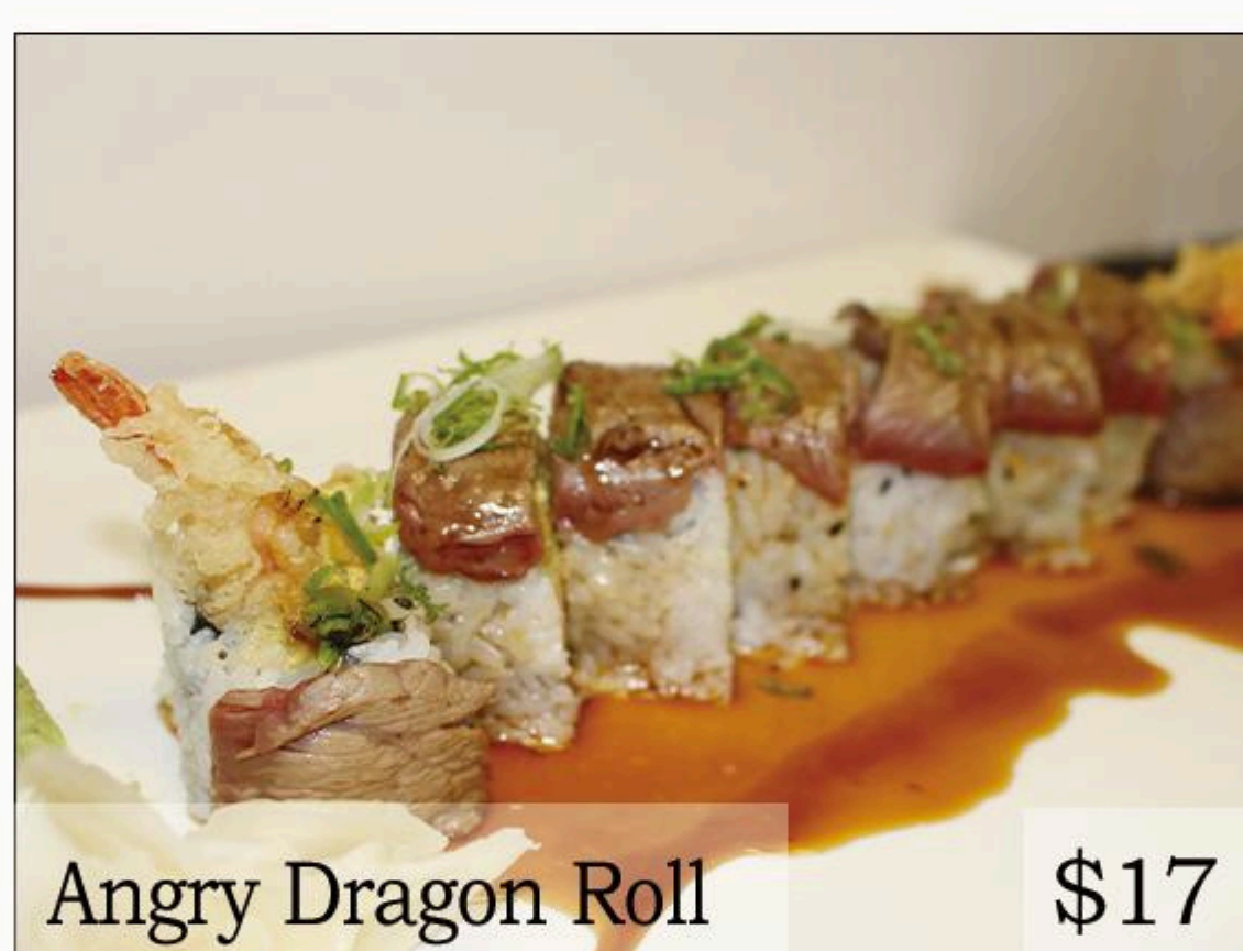
Angry Dragon Roll $17

crabstick, cream cheese & snow crab, topped with avocado, steamed shrimp & topped with miso and wasabi sauce