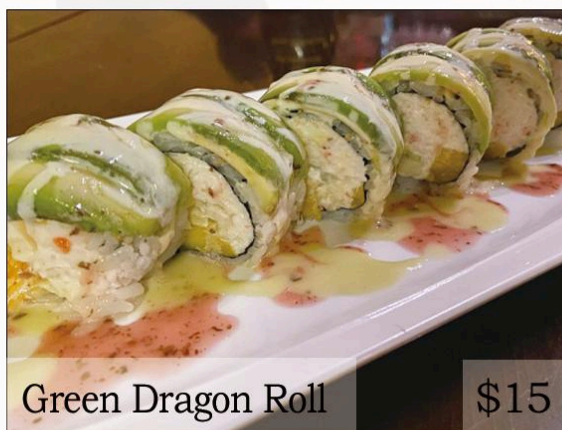
Green Dragon Roll $15

crab stick, avocado, cucumber, & cream cheese inside, topped with spicy kani salad & tempura flakes