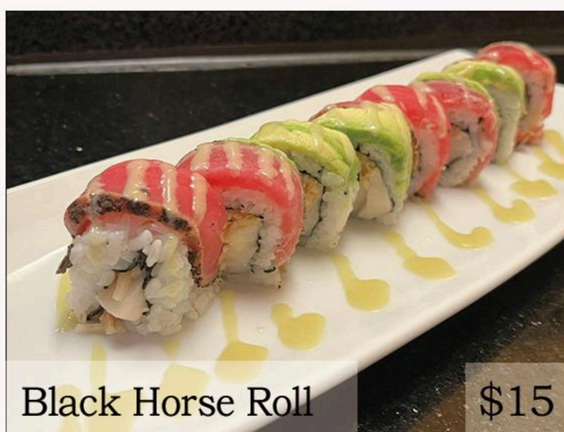
Black Horse Roll

shrimp tempura & spicy salmon topped with avocado, sliced red tuna & miso sauce