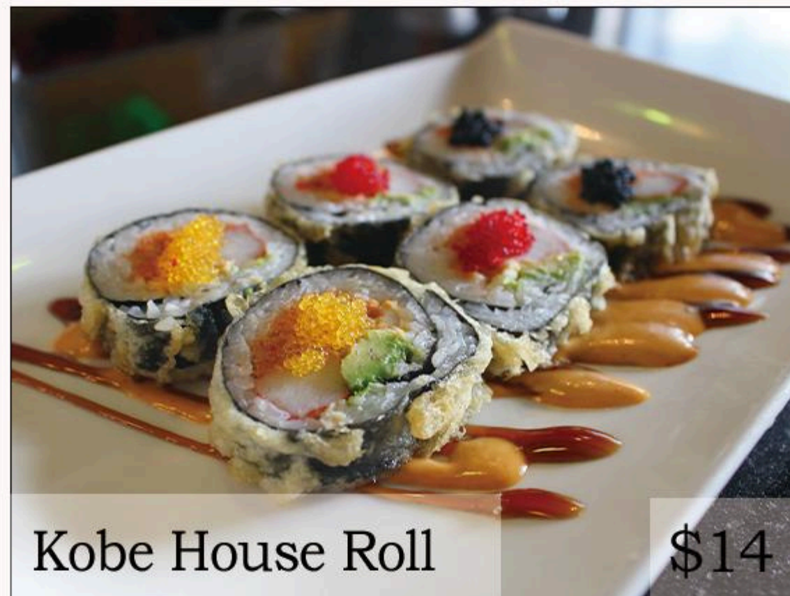
Kobe House Roll $14

deep fried roll with spicy tuna, spicy salmon, crabstick, avocado, topped with 3 kinds of tobiko and drizzled with spicy mayo and eel sauce