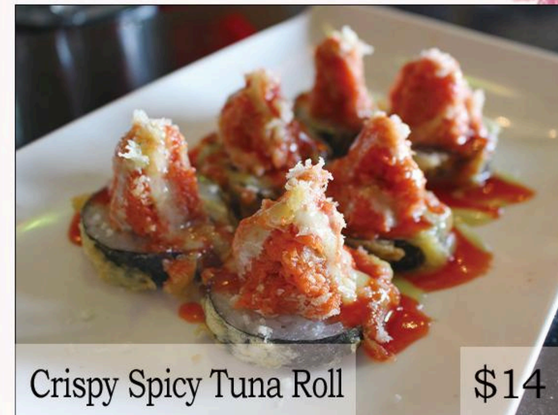
Crispy Spicy Tuna Roll $14

avocado, mango, shrimp tempura, cucumber, spicy kani, topped with red tobiko