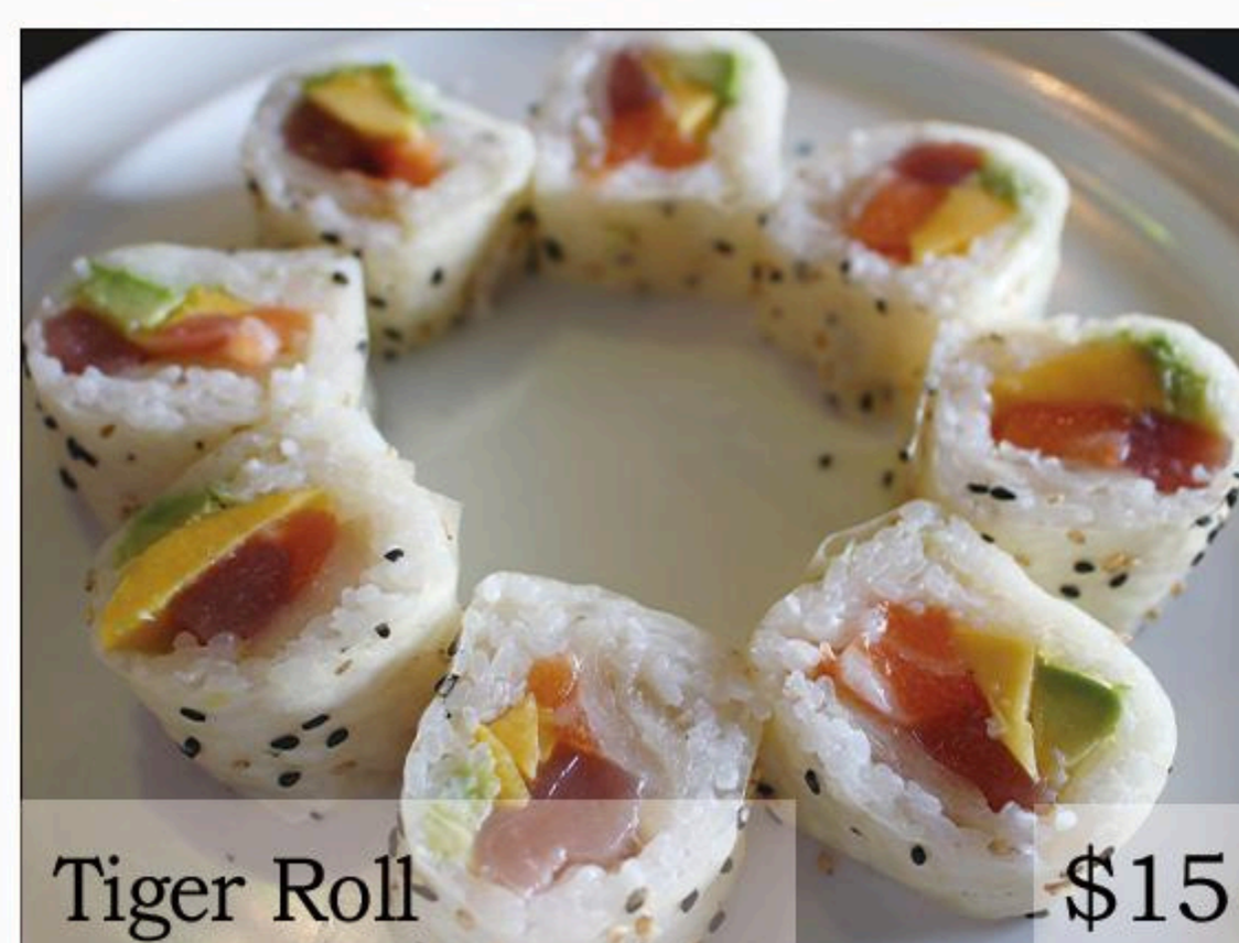
Tiger Roll $15

peppered tuna, tempura crunch, asparagus, topped with salmon, eel, avocado & spicy mayo