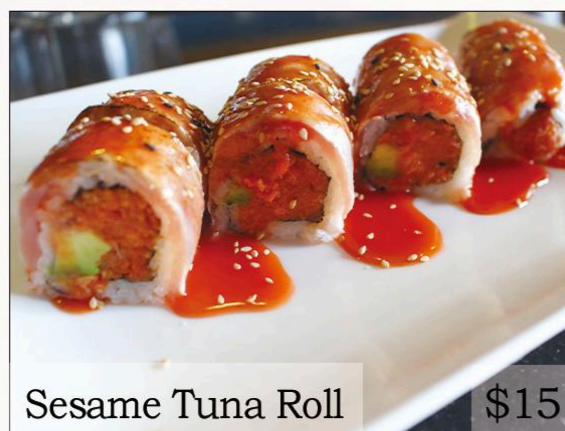
Sesame Tuna Roll $15

shrimp tempura & avocado, topped with spicy crunchy tuna and spicy mayo