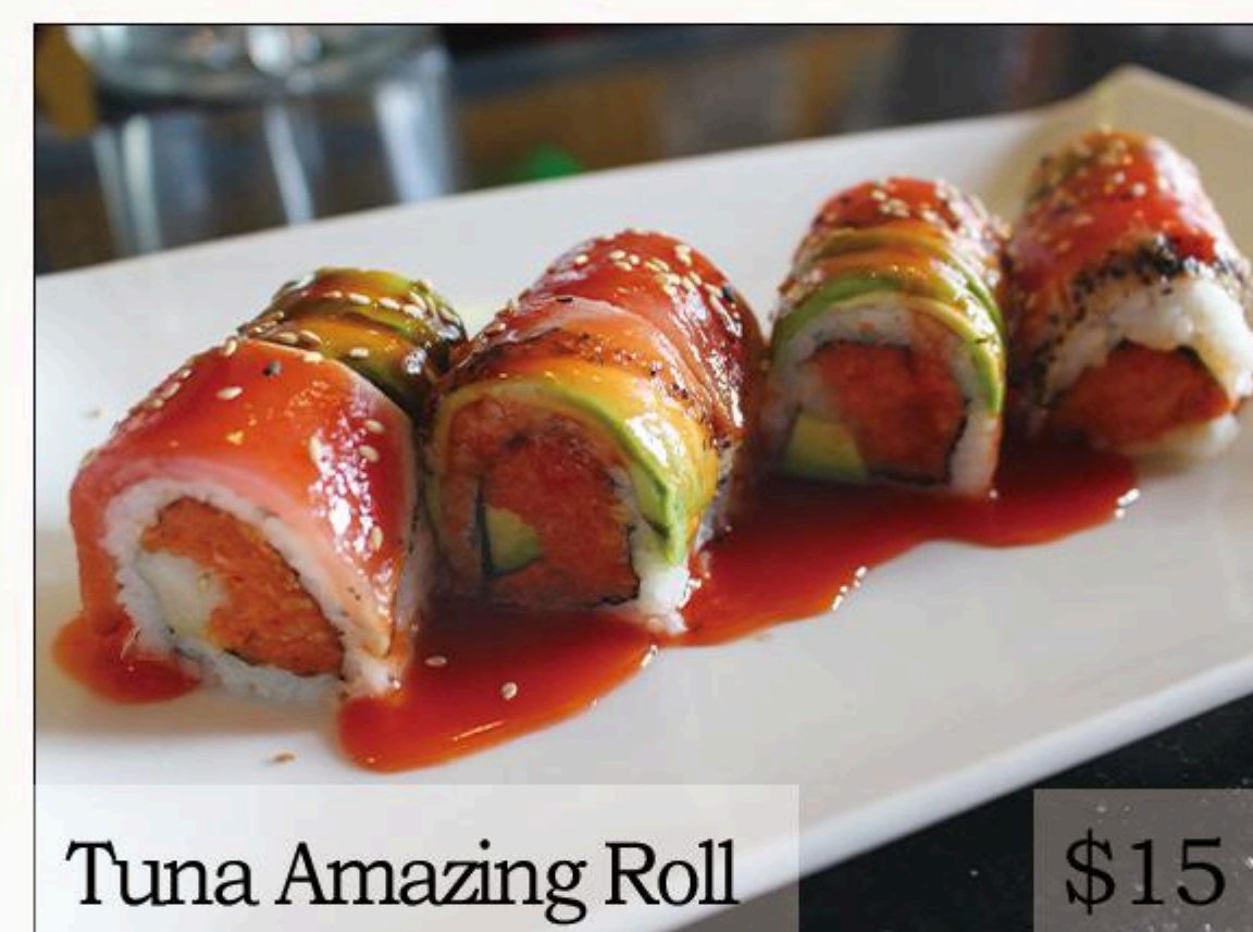
Tuna Amazing Roll $15

spicy tuna & avocado wrapped inside, topped with seared tuna & drizzled in plum sauce