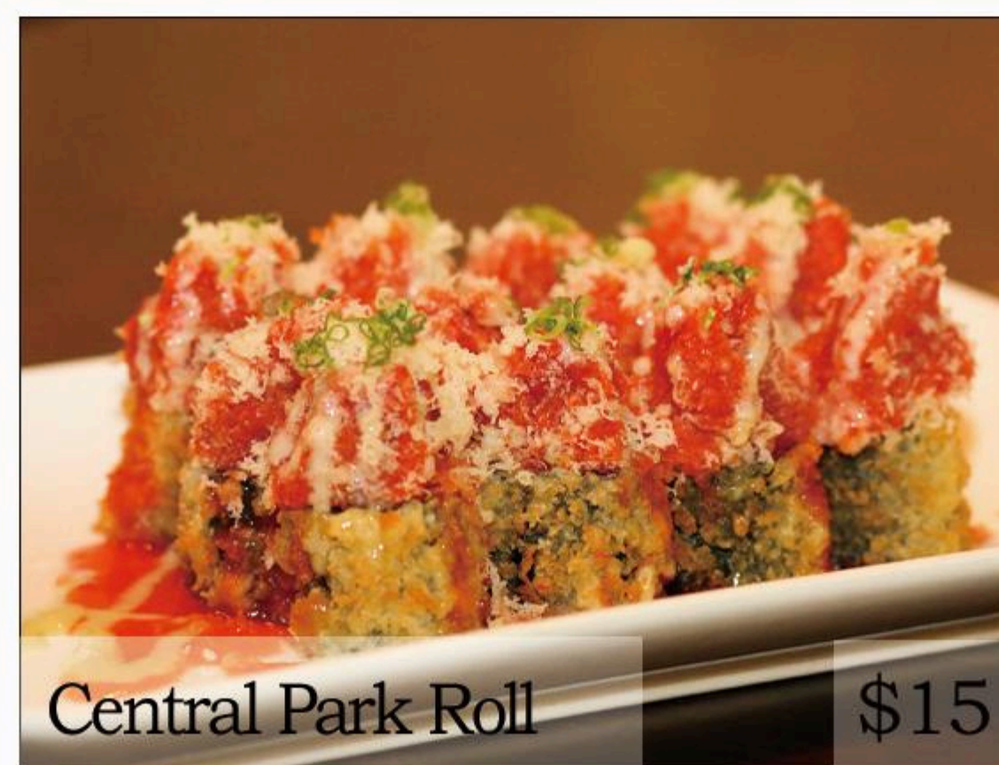
Central Park Roll

spicy tuna inside & topped with eel, avocado, steamed shrimp and drizzled with wasabi sauce