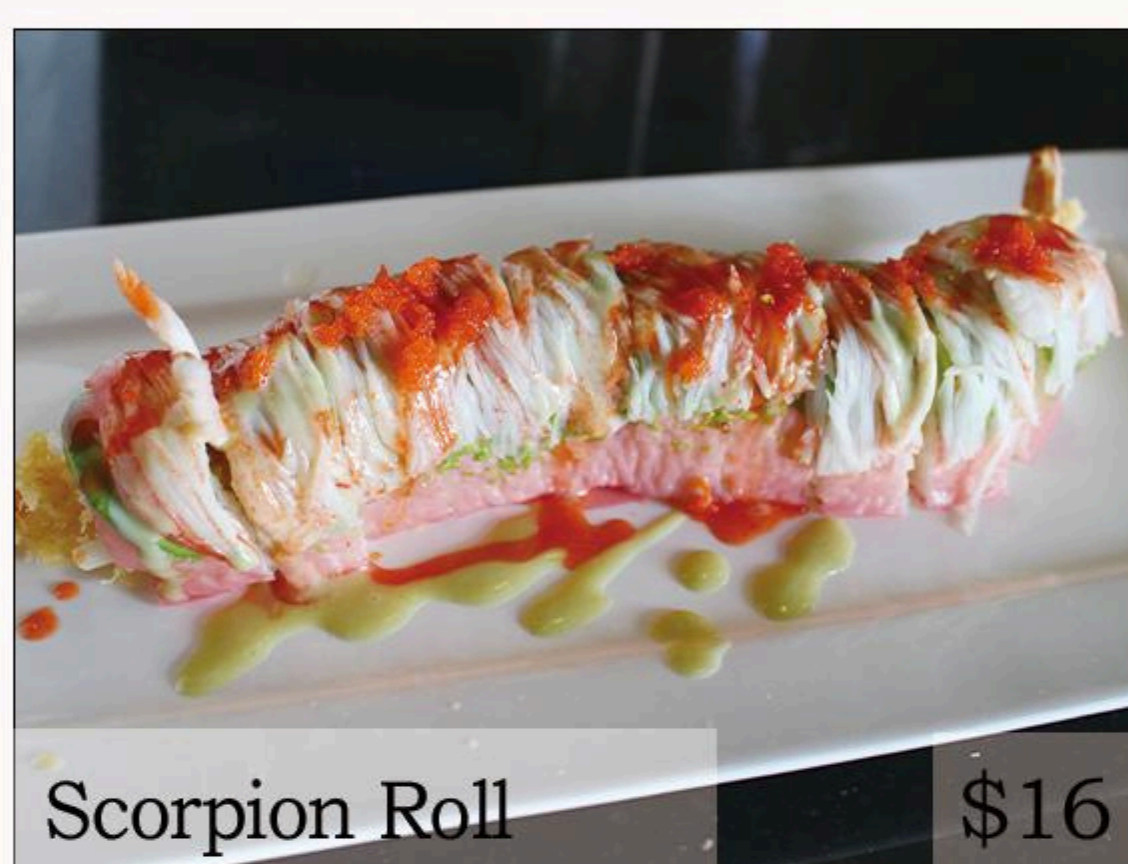
Scorpion Roll $16

snow crab, cream cheese, eel & avocado wrapped inside, topped with seared salmon, spicy mayo & eel sauce