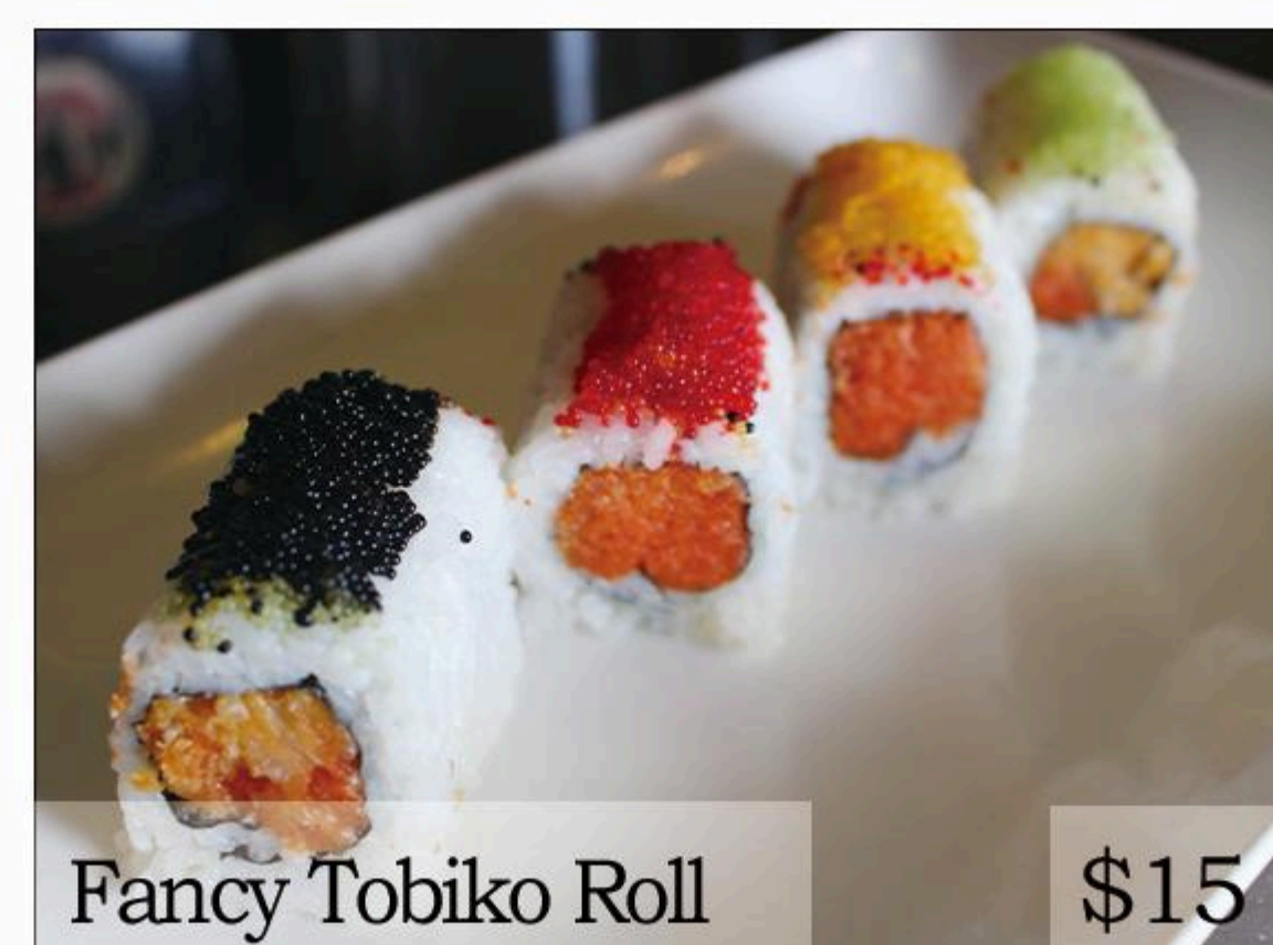
Fancy Tobiko Roll $15

tuna, salmon, yellowtail, avocado, mango, and masago wrapped in sesame soy paper