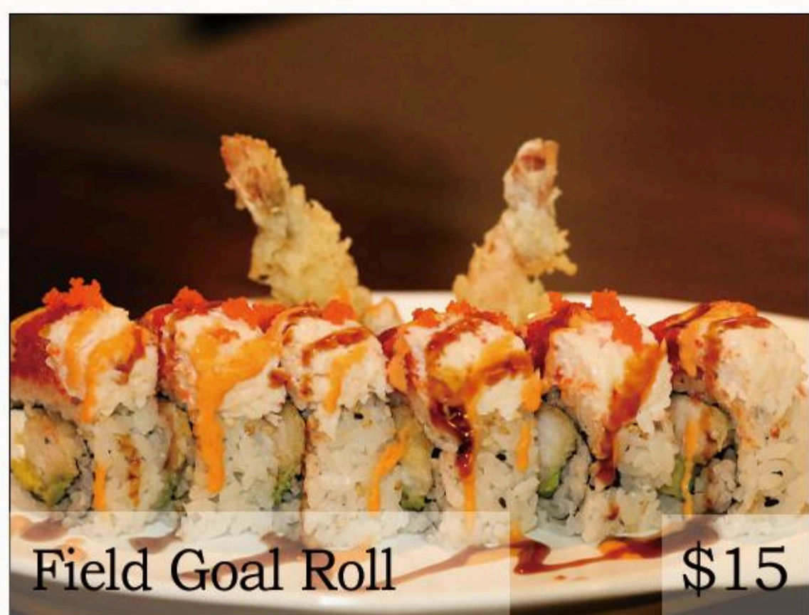
Field Goal Roll

shrimp tempura, spicy tuna, & mango inside, topped with spicy kani salad, & drizzled in eel and spicy mayo