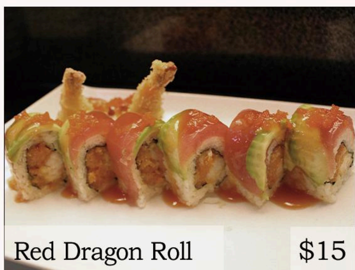
Red Dragon Roll

spicy tuna, snow crab, avocado & asparagus wrapped in pink soy paper, drizzled with sriracha