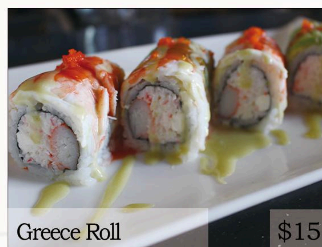
Greece Roll $15

shrimp tempura, cream cheese, cucumber & jalapeño wrapped inside with avocado, crabstick, topped with eel sauce and wasabi sauce