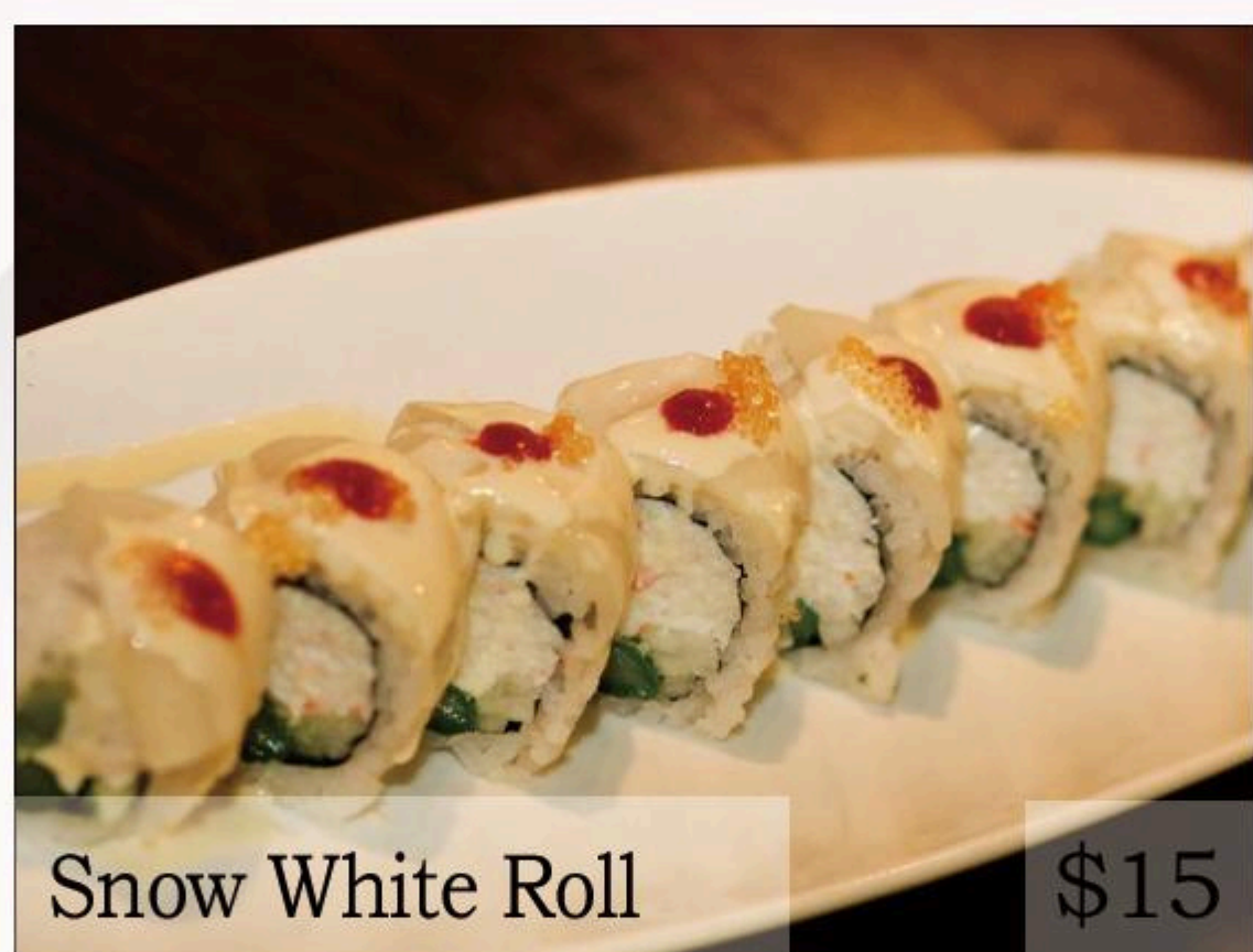
Snow White Roll

salmon, avocado, cucumber, & cream cheese inside, spicy tuna, & spicy crab on the outside, topped with wasabi & eel sauce