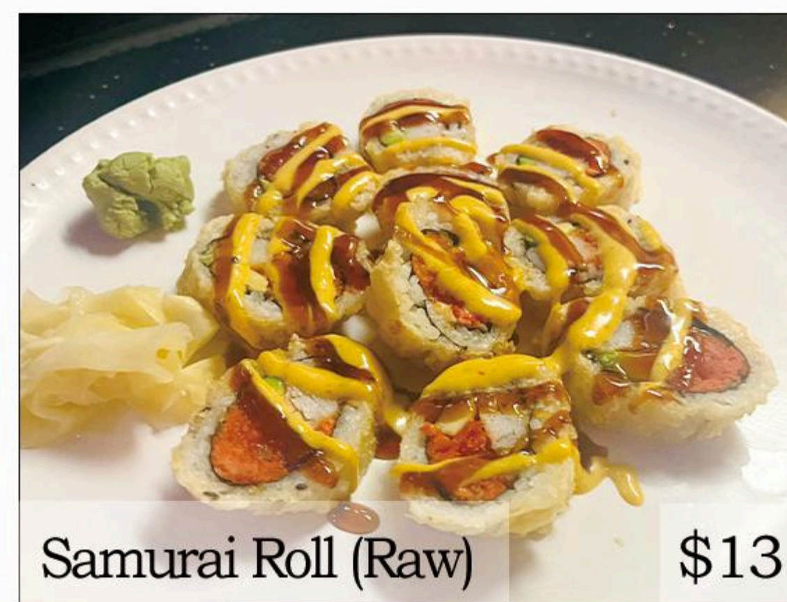
Samurai Roll (Raw) $13

spicy crab, jalapeño, avocado, cucumber & shrimp tempura inside, topped with snow crab, drizzled with spicy mayo & eel sauce