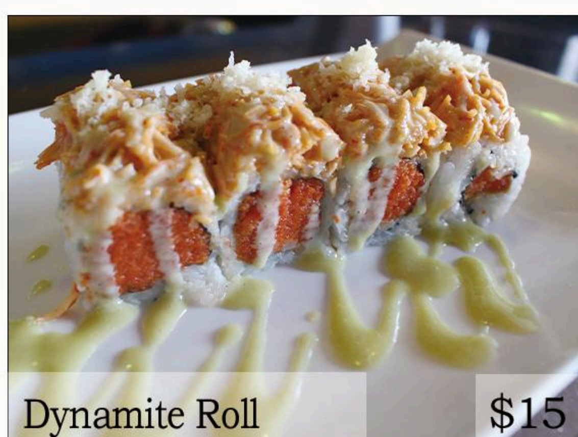
Dynamite Roll $15

chef's choice of white fish, spicy tuna & avocado, topped with peppered tuna & sweet miso sauce