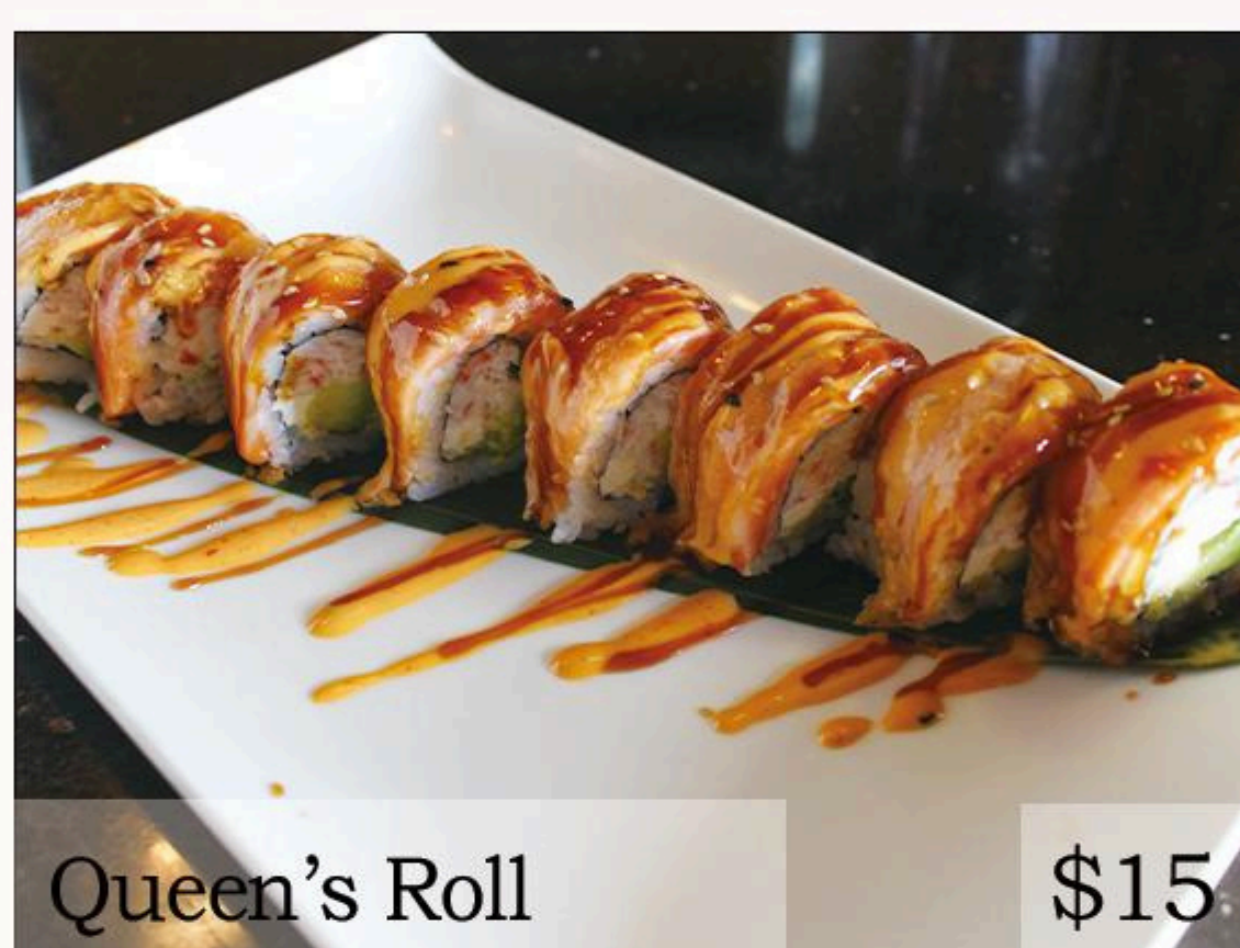
Queen's Roll $15

shrimp tempura, eel, avocado & cucumber, topped with mango and drizzled with eel sauce