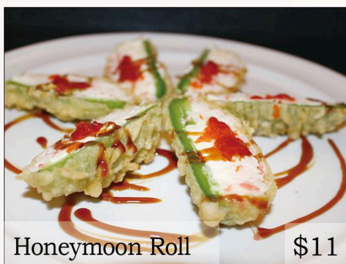
Honeymoon Roll $11

deep fried jalapeño stuffed with avocado, cream cheese & snow crab, topped with eel sauce & sriracha