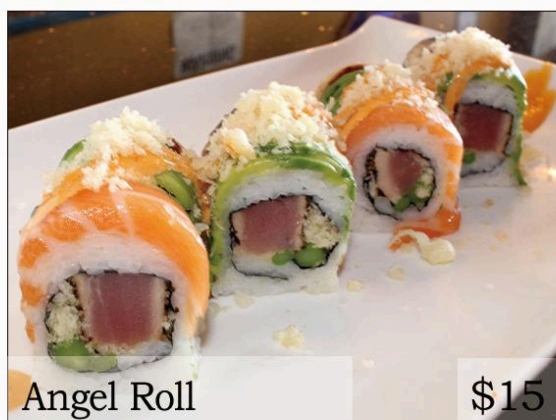
Angel Roll $15

spicy tuna, spicy salmon, spicy yellowtail & avocado topped with masago, drizzled with spicy mayo