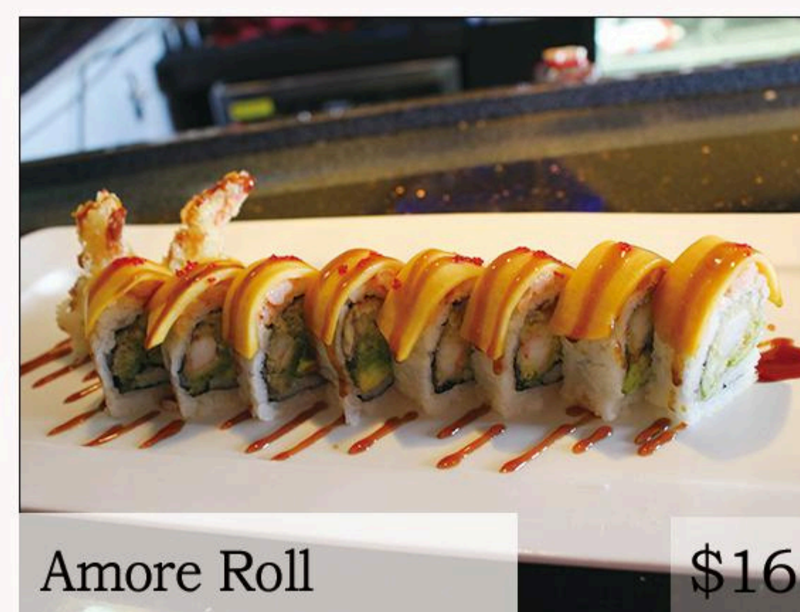
Amore Roll $16

crabstick, seaweed salad, cream cheese, avocado, cucumber topped with seared tuna and drizzled with eel & wasabi sauce